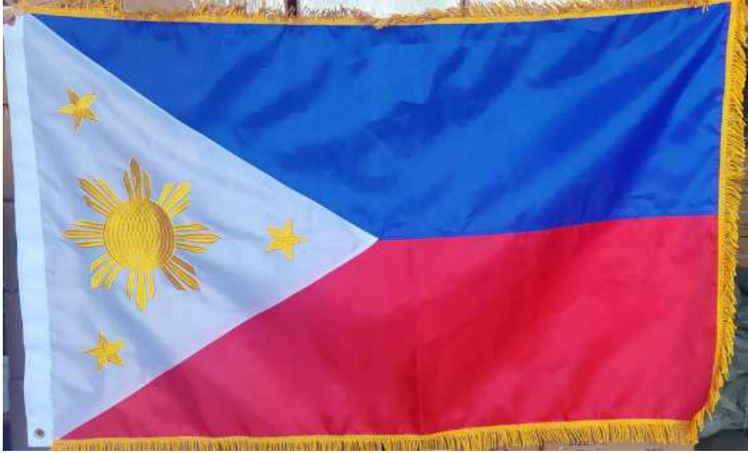
1 PIECE – PHILIPPINE FLAG