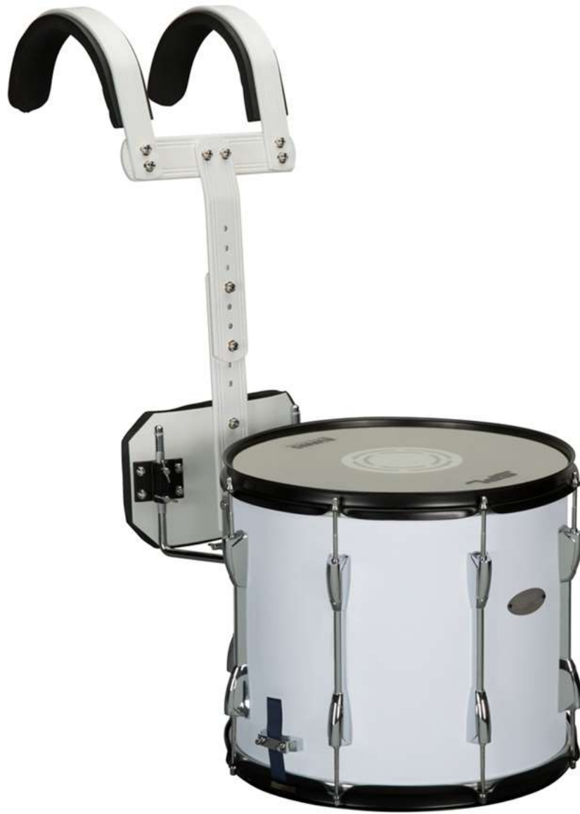
2 SETS – MARCHING SNARE DRUMS SET (WITH HARNESS AND STICKS)