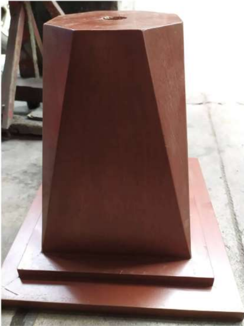
4 PIECES – WOODEN FLAG POLE AND WOODEN BASE