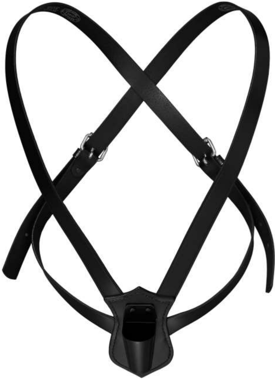
4 PIECES – FLAGPOLE LEATHER CARRYING HARNESS (BLACK)