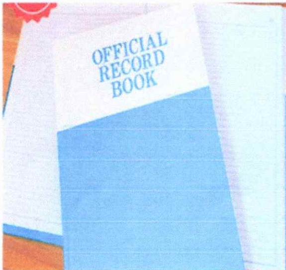
RECORD BOOK 8.5" x 11" 300's & 500's