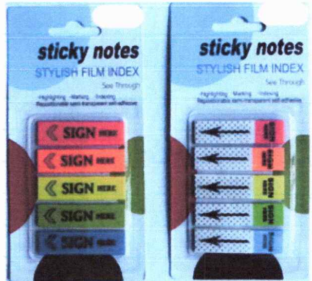
SIGN HERE STICKER