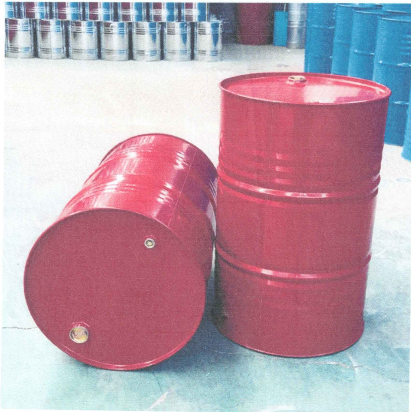
5 Units for Gasoline - RED