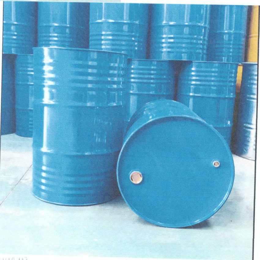
10 Units for Diesel - BLUE

RECEIVED BAC SECRETARIAT 244 RAMON PRISON AND PENAL FARM DATE & TIME 15:00 1/15/10 1/15/10