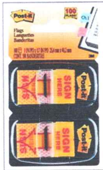
POST-IT FLAG SIGN HERE

SIGNATURE OVER PRINTED NAME OF SOLE PROPRIETOR OR REPRESENTATIVE